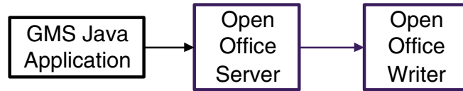
Figure 2. The OpenOffice.org solution is significantly simpler and works across platforms.

OpenOffice.org has an export to PDF facility that eliminates the need for the Adobe PDF writer. This facility is also used by developers to exchange documents across platforms.